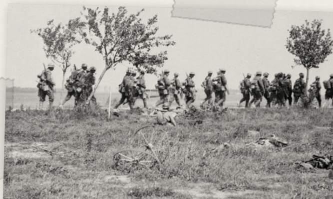
Canadians advancing during the Battle of Amiens. French troops in foreground.

For a more comprehensive overview of the battles and the role of Canadian forces, please visit the Canada’s Hundred Days Collection on The Canadian Encyclopedia .