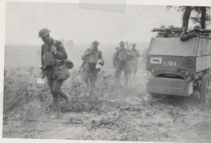
Canadian armoured cars going into action at the Battle of Amiens (courtesy Library and Archives Canada/PA-003016).

Personnel Records of the First World War Database