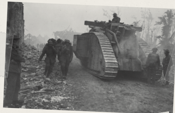
Tanks advancing down Amiens-Roye Road. Battle of Amiens. August, 1918.

For insight into the impact of shelling, watch the silent film Canadians Advance Near Cambrai 3 on the National Film Board website.